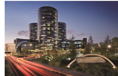
Winnie Palmer Hospital for Women & Babies