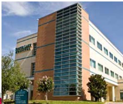
South Lake Hospital