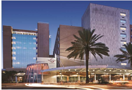
Orlando Regional Medical Center