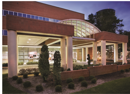
Arnold Palmer Hospital for Children