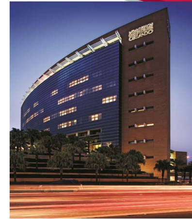
M.D. Anderson Cancer Center Orlando