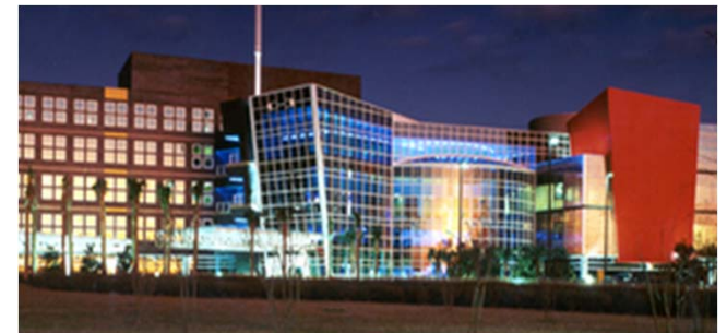
Health Central Hospital