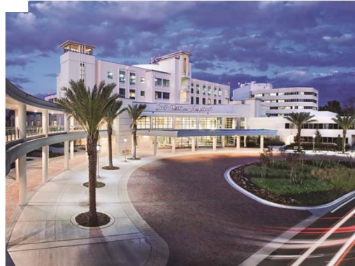
Dr. P. Phillips Hospital