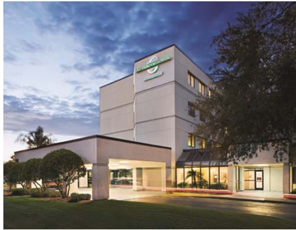
South Seminole Hospital