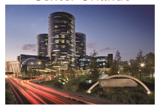
Winnie Palmer Hospital for Women & Babies