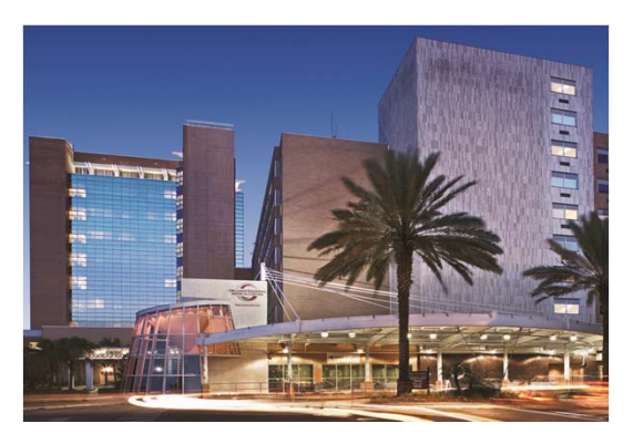
Orlando Regional Medical Center