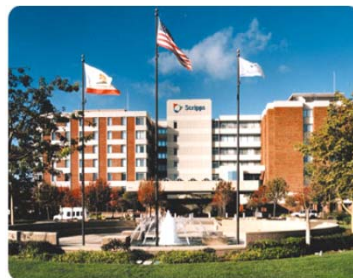
Scripps Memorial Hospital La Jolla