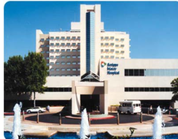
Scripps Mercy Hospital (San Diego Campus)