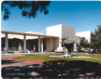
Scripps Green Hospital