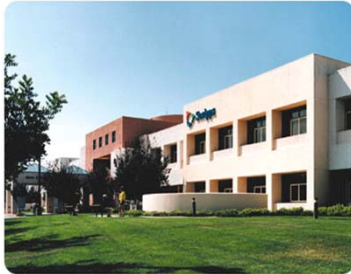
Scripps Memorial Hospital Encinitas