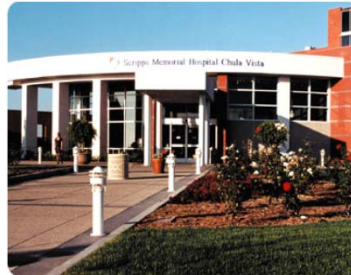
Scripps Mercy Hospital (Chula Vista Campus)